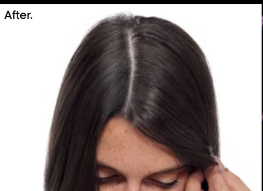
Dia color 5/5N & DIActivateur Developer 15-vol.