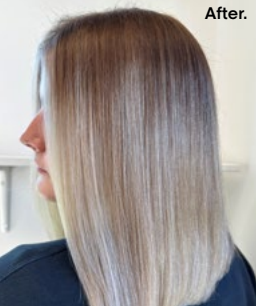
Dia color 2/3 8.2/8V + Dia color 1/3 6/6N with DIActivateur 9-vol.