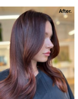
Dia color 5/5N + 5.35/5GRv + 5.5/5Rv with DIActivateur 9-vol.