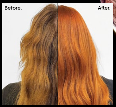
Dia color 8.43/8CG + 7.44/7CC + 5.4/5C with DIActivateur Developer 15-vol. @ningrubelhair