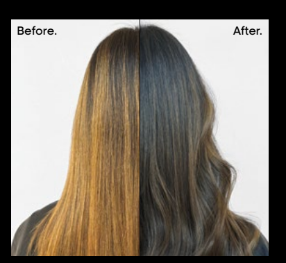
Dia color 1/2 5/5N + 1/4 8.2/8V + 1/4 6.1/6B with DIActivateur Developer 9-vol.