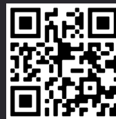
Download sell-thru assets on LEVEL