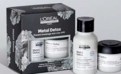
Travel sets Mini kits include: Shampoo 3.4 oz Mask 2.5 oz