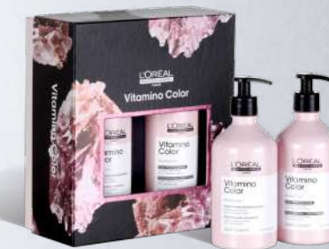
Vitamins Color. For color preservation. Kit includes: Shampoo 16.9 oz Conditioner 16.9 oz