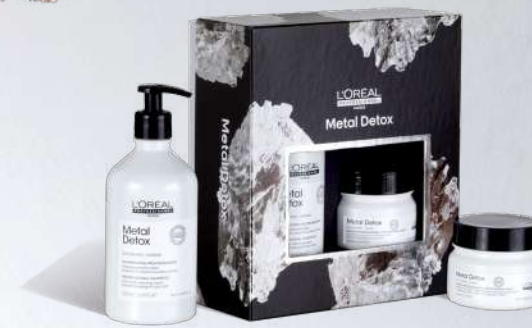
Metal Detox. For color treated hair. Kit includes: Shampoo 16.9 oz Mask 8.5oz