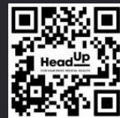
Discover free mental health resources

LEARN MORE ABOUT L'ORÉAL PROFESSIONNEL AT