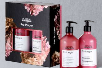
Pro longer. For thinned ends. Kit includes: Shampoo 16.9 oz Conditioner 16.9 oz