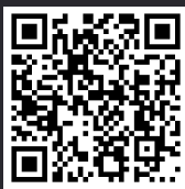
Stay up-to-date with our newsletter