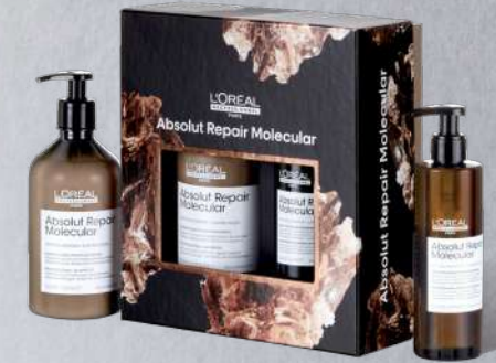
Absolut Repair Molecular. For very damaged hair. Kit includes: Shampoo 16.9 oz Rinse-off serum 8.4 oz