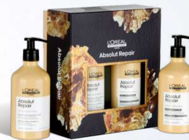
Absolut Repair. For sensitized hair. Kit includes: Shampoo 16.9 oz Conditioner 16.9 oz