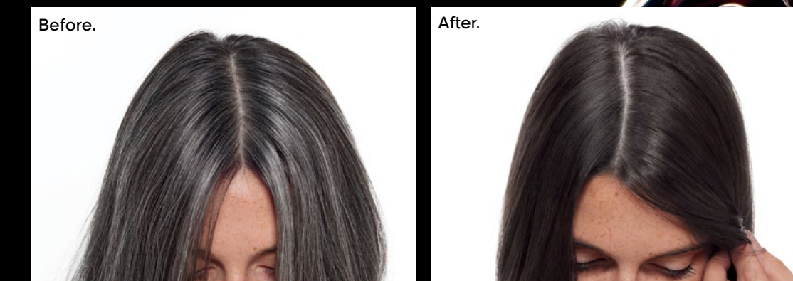
Grey blending with Dia color 5/5N & DIActivateur Developer 15-vol.

Fills gaps from lost melanin by reinjecting color inside the fiber. Up to 92% natural origin formula.* No ammonia.