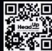
Discover free mental health resources

LEARN MORE ABOUT L'ORÉAL PROFESSIONNEL AT