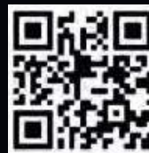
Download sell-thru assets on LEVEL